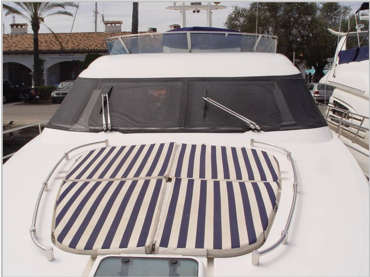
Bossy Sq 58